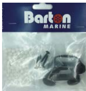
18210 Dinghy Traveller Service Kit Balls and end caps for the standard length cars.

Inspecting the condition of your existing end caps which hold the ball bearings within the ball race as these can be damaged by crash gybes and salt degradation over time. Any damage here will result in ball bearings being lost and failure of the traveller car.