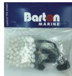
24210 Size 2 Traveller Service Kit Balls and end caps for the standard length cars.