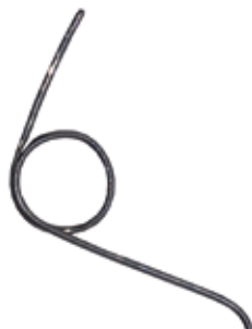
60124 S - Springs Suitable for a range of archive Barton and other manufacturers winches.