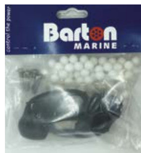
30210 Size 3 Traveller Service Kit Balls and end caps for the standard length cars.