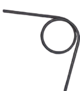
60125 V - Springs Suitable for a range of archive Barton and other manufacturers winches. Arms approximately 25mm (1") long