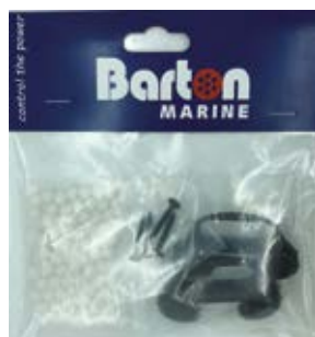
20210 Size 1 Traveller Service Kit Balls and end caps for the standard length cars.