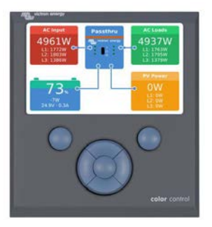
Color Control panel, showing a PV application

When connected to the Ethernet, systems with a Color Control panel can be accessed and settings can be changed.