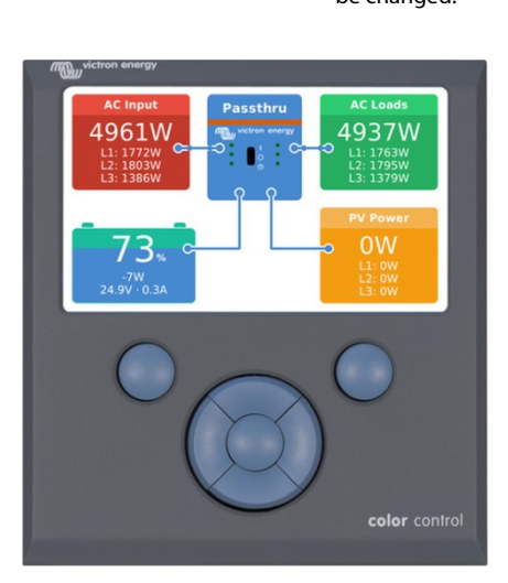
Color Control Panel, showing a PV application

When connected to the Ethernet, systems with a Color Control panel can be accessed remotely and settings can be changed.